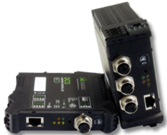
DCS-100E and DCS-103E Shown