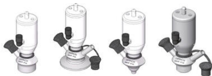
Indsvejsning på tank