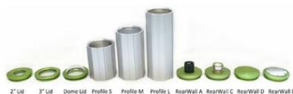
Order Numbers (please specify the camera type for each order):