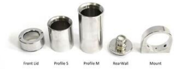
Front Lid Profile S Profile M Rear Wall Mount