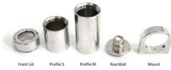
Front Lid Profile S Profile M Rear Wall Mount